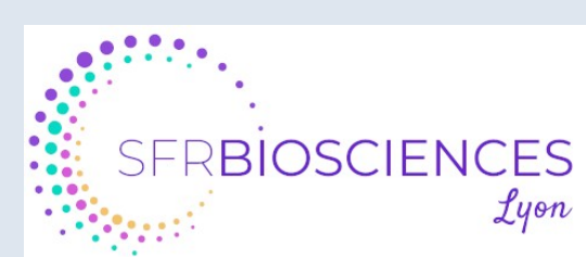
Sébastien Dussurgey Estelle Devevre